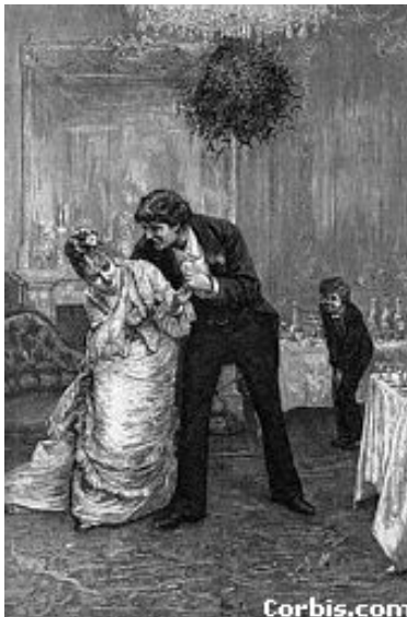
(Stolen Kiss Under the Mistletoe – Frederick Barnard)